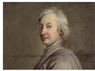
ALL FOR LOVE (1677). JOHN DRYDEN