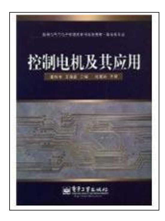
Filesize: 6.22 MB