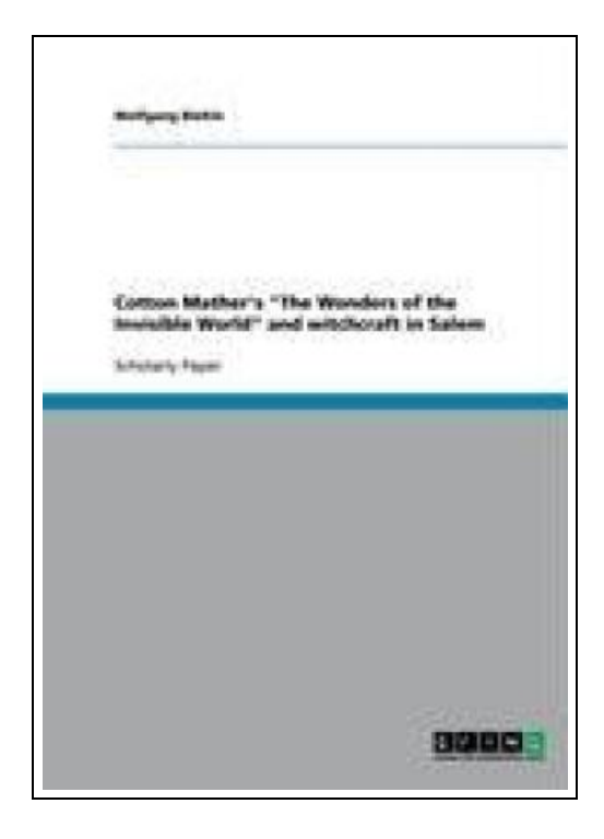
Filesize: 3.12 MB